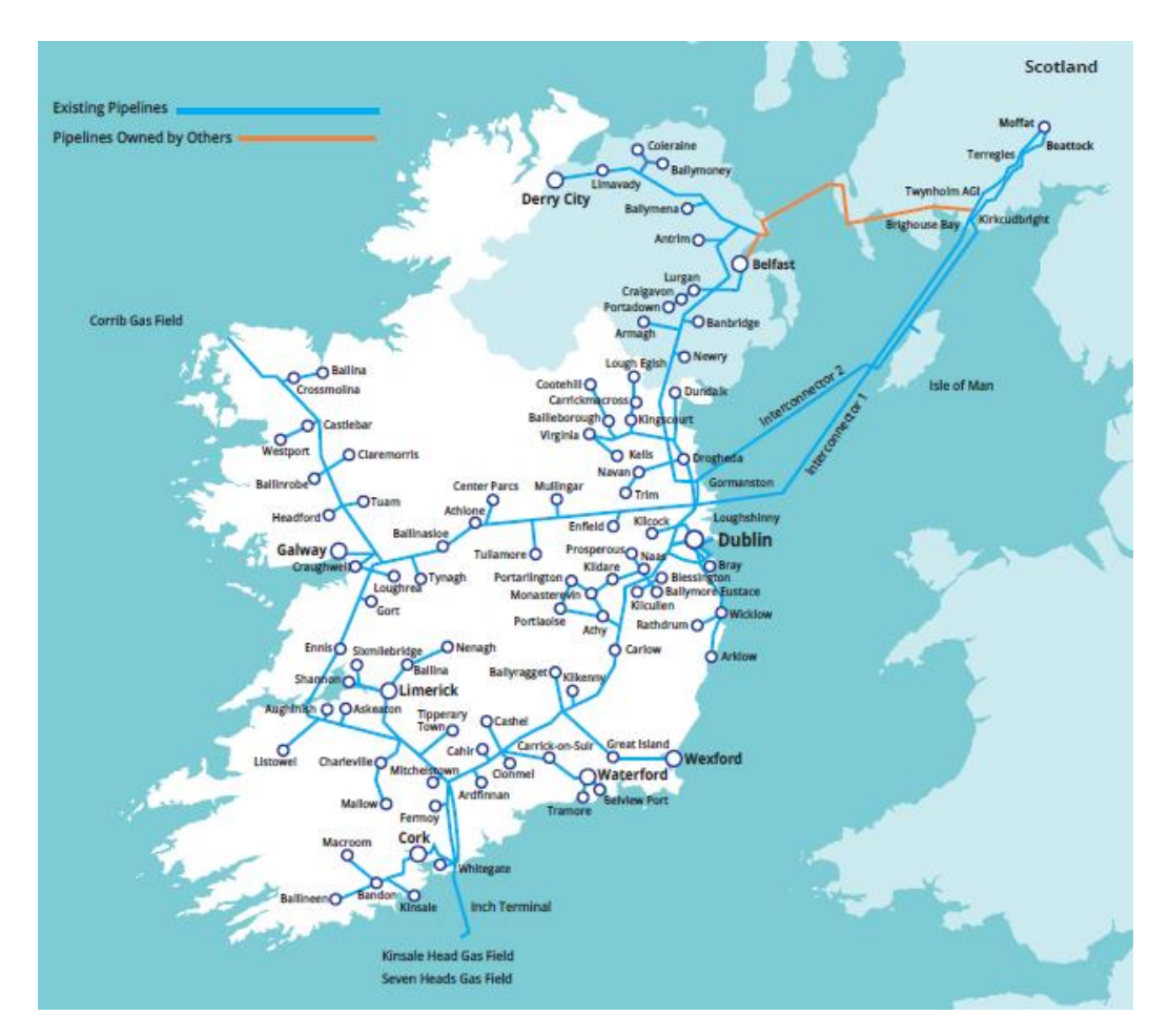
Figure 4.1: NDP Plan Area