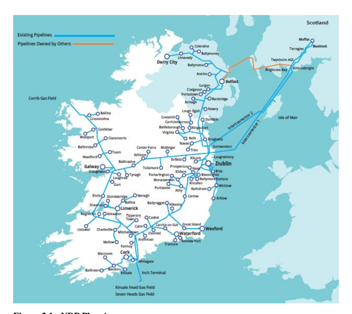
Figure 2.1: NDP Plan Area