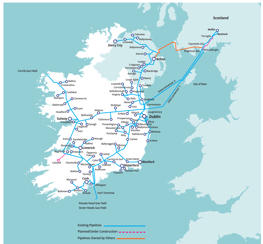
Natural gas pipeline map